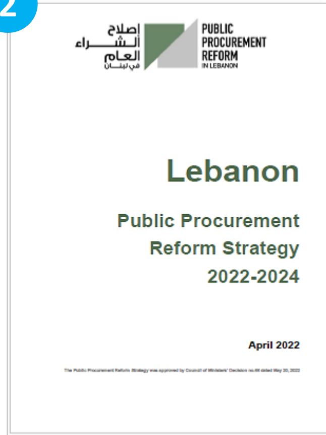
National Reform Strategy, 2022 GPP-MDTF Type 2