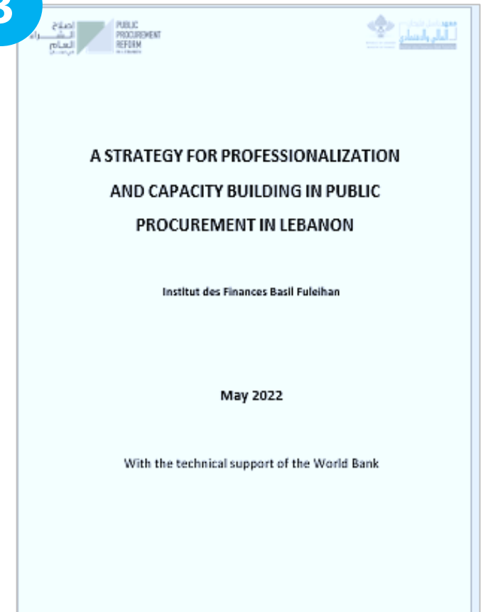
Capacity Building Strategy, 2022 World Bank Financing